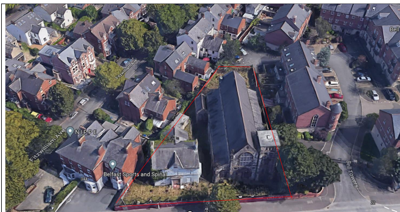
Arial image – site outlined red