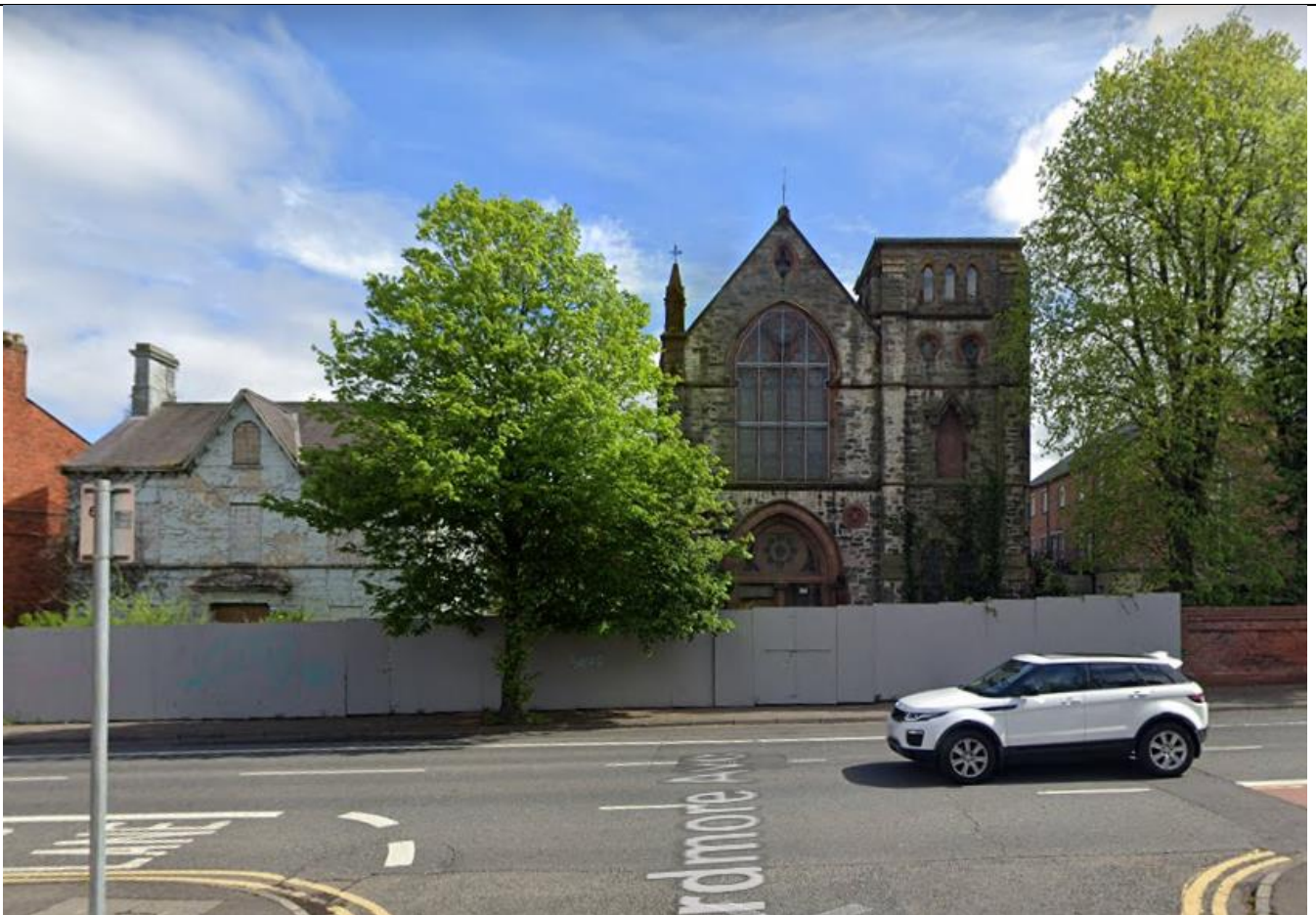
Front of site