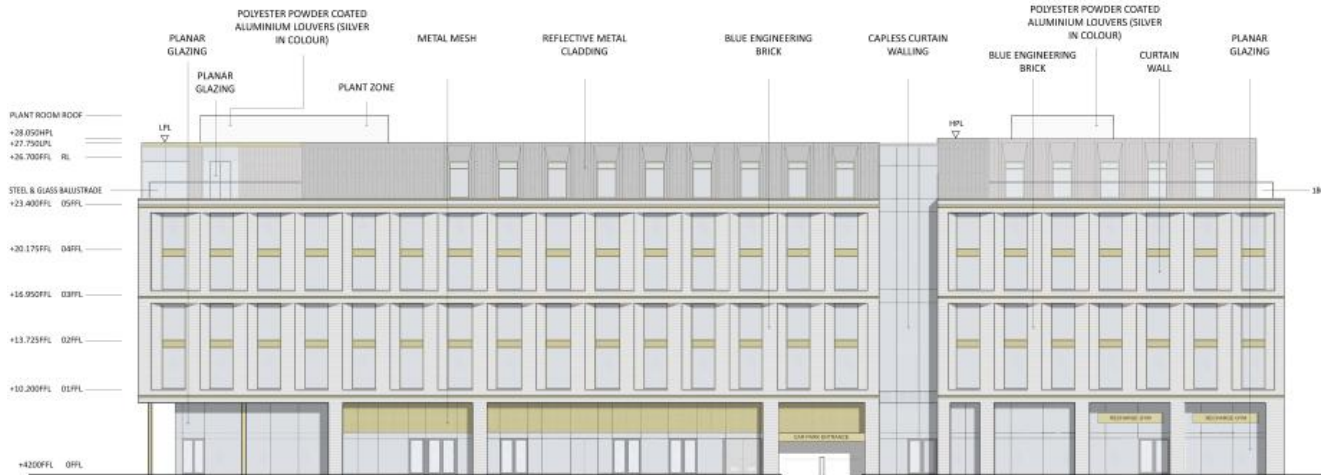
PROPOSED ELEVATION 03