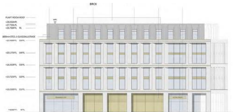
PROPOSED ELEVATION 02