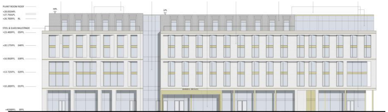
PROPOSED ELEVATION 01