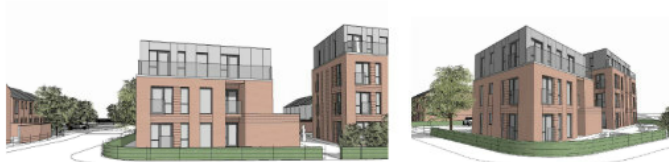
3D VIEWS OF APT BLOCK B