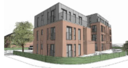
3D VIEW OF APT BLOCK B