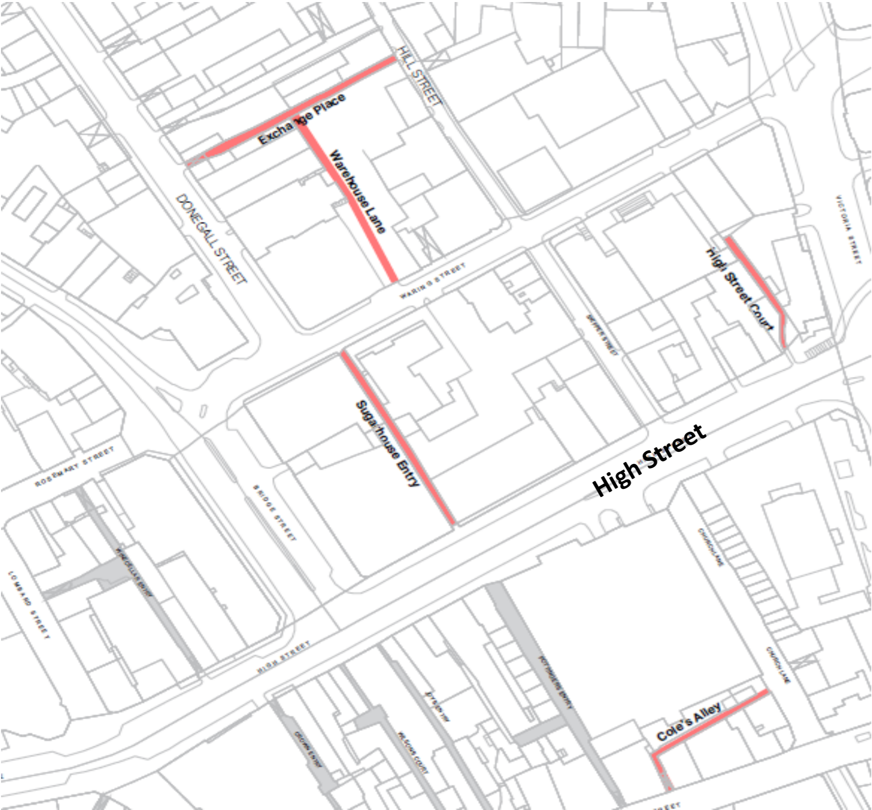
Exchange Place / Warehouse Lane / Sugarhouse Entry / High St Court / Cole's Alley